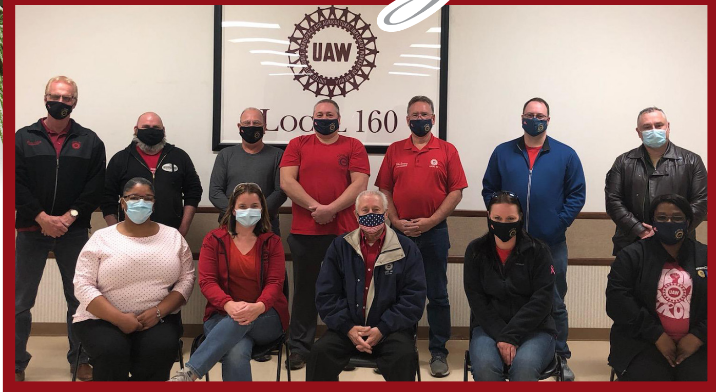
Pictured Above: Local 160 Executive Board