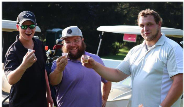
Participants toast to a successful Local 160 golf outing event!